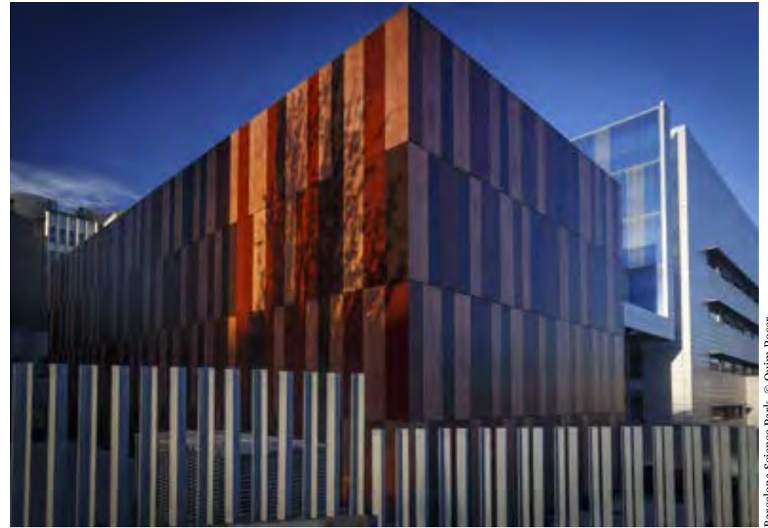
Barcelona Science Park.

In the nineteenth century, with industrialisation and the consequent large population surge, an entire new nucleus began to spring up around the Sant Ramon parish church, with new homes, businesses and factories. In parallel, taking advantage of the lands belonging to a former farmhouse, construction on the Casa Provincial de La Maternitat i Expositors of Barcelona got underway, a care facility designed with the goal of improving the healthcare and living conditions of infants and mothers. These two phenomena are the source of the neighbourhood's current name, the legacy of both the rural past that was so important to the development of the zone and the scientific and technological innovations that industrialisation brought to Barcelona.