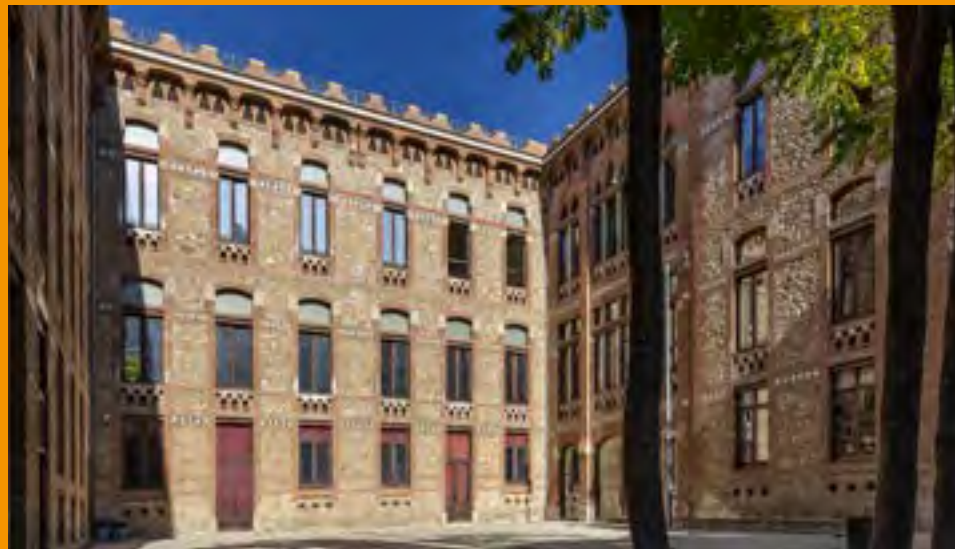
CAP Les Corts, the Maternitat hospital and the History Archive of the Barcelona Provincial Council.

However, the primary goal of the Casa Provincial de la Maternitat i Exposits was to care for infants. In order to improve their living conditions, it was not enough to merely move them to more modern buildings far from the overpopulation of Barcelona with gardens where they could play. Other factors also had to change.